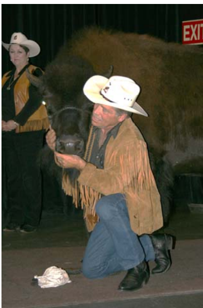
A warm welcome to all the delegates was assured by this kindly bison who stopped by at the Opening Ceremony!

new approaches to control in the age of drug resistance. Indeed, the plenary speakers focused attention on the dynamic and interactive world in which we find ourselves immersed.