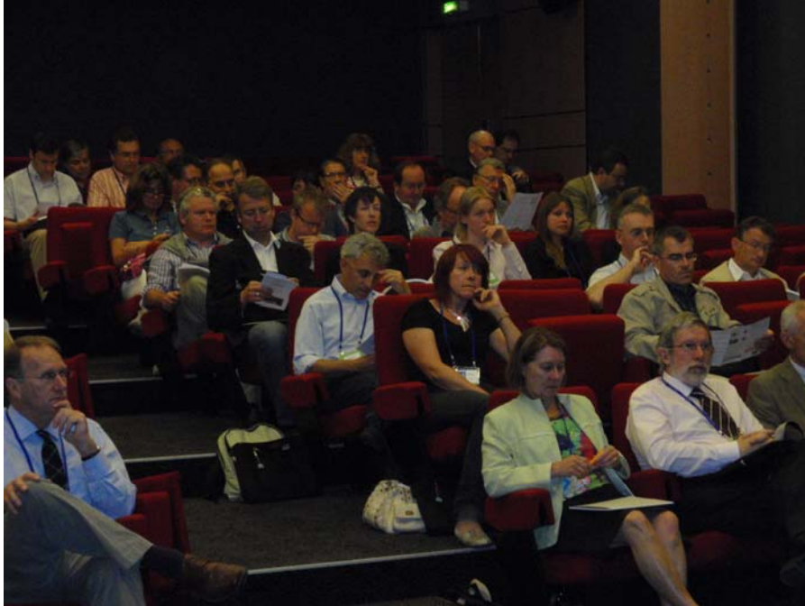
EVPC members enjoying the science in Toulouse

studies were conducted recently, Jacquet emphasized the great need for further basic research in order to answer many questions still unanswered about this protozoa. This was the nice picture for the parasites of the Mediterranean area!