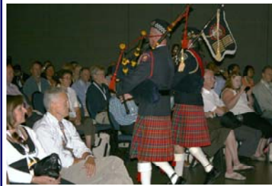
WAAVP delegates are accompanied to the coffee break by the stirring sound of bagpipes.

between humans, their domestic animals, wildlife and the environment. The number of topics covered in the concurrent sessions was vast and included epidemiology, pathogenesis and immunology, wild life parasitology, drug resistance, etc. Many sessions also concentrated on integrated