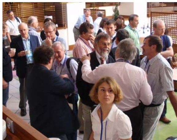
EVPC members at the coffee break

See Domenico Otranto's summary of the Scientific Symposium on the following page!