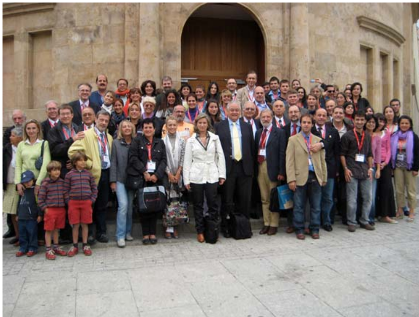
Attendees of the Second European Dirofilaria days, Salamanca, Spain

During the Second European Dirofilaria Days, held in Salamanca (Spain) on September 16 th - 18 th 2009, the general Assembly voted unanimously to found the "European Dirofilaria Society" (EDiS). The proposal to form a Society resulted from the growing interest in Dirofilaria immitis and Dirofilaria repens infections both in humans and animals, their