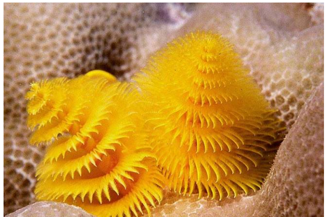
Decoration for the helminthologist: A Christmas Tree worm....